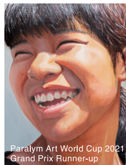
Paralympic Art World Cup 2021 Grand Prix Runner-up

The theme for the Paralympic Art World Cup 2022 is "FUTURE". Each person has his or her own vision of the "FUTURE". We are calling artists from all over the world to submit artwork that expresses your vision of "FUTURE". The Grand Prix winner and the Runners-up will also win a cash prize of 300,000 yen and 100,000 yen respectively. We look forward to receiving your submission.