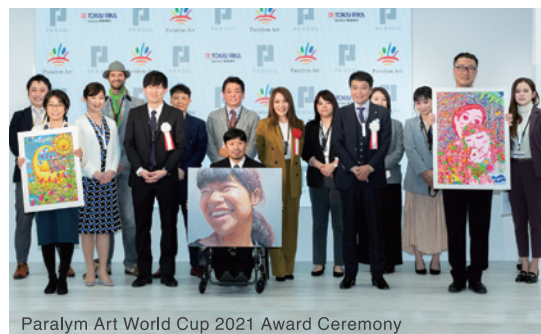
Paralympic Art World Cup 2021 Award Ceremony